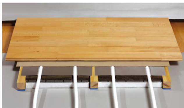
Installation of flooring over under floor heating ducts

For installations over under floor heating, it is essential you limit the selection of species to those with small movement characteristics. Maximum board widths of 75mm are normally recommended for under floor heating installations, although wider commercial products are becoming available which may require special precautions to avoid in-service movement. You must also ensure that the moisture content of boards intended for under floor heating installations is between 6% and 8% when the floor is laid.