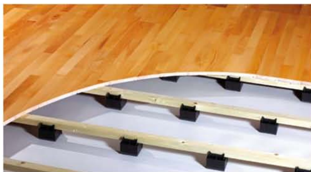
Installation of sports hall floor over battens supported by cradle supports

The flooring is either face-nailed or secret-nailed to support battens or joists. The floor is therefore firmly fixed, with each element of the floor being individually fixed to the supports.